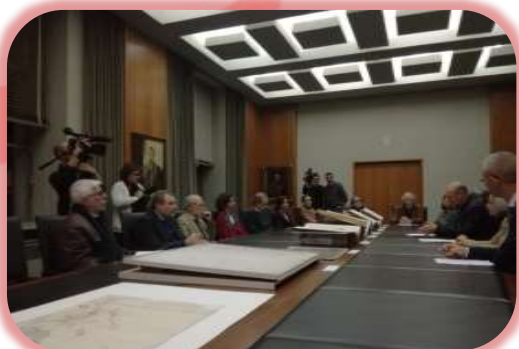
Presentation of the 3rd Phase of the Macau/China Digital Library, December 2018