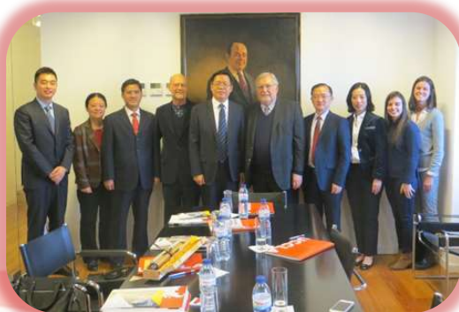
Jiangsu Congress Delegation, November 2018