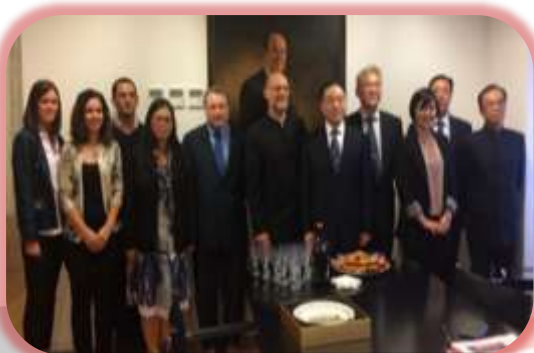
Delegation of the Chinese Academy of Social Sciences, October 2018

The OBSERVATORY FOR CHINA (OC) , founded on December 28, 2005, it presents the newsletter with the main initiatives between April 2018 and December 2018.