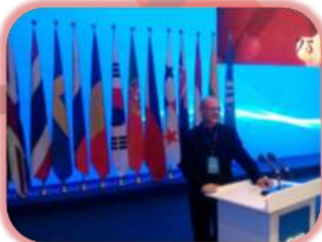
World Canal Cities Forum, October 2018