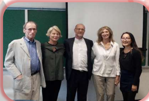
Disclosure of OC Projects to Universities in the USA and China, September and October 2018