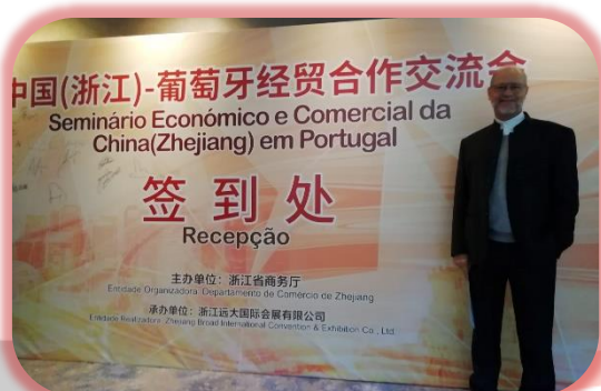
Participation in the China Economic and Commercial Seminar in Portugal

The OBSERVATORY FOR CHINA (OC) , founded on December 28, 2005, presents the newsletter with the main initiatives between January 2023 and December 2023.