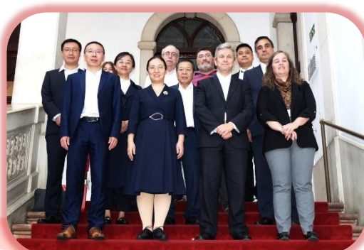
Guangzhou delegation received at Coimbra City Hall